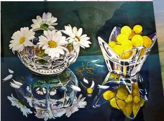
Award of Excellence 1 — Sweet Decisions By Oral Carper