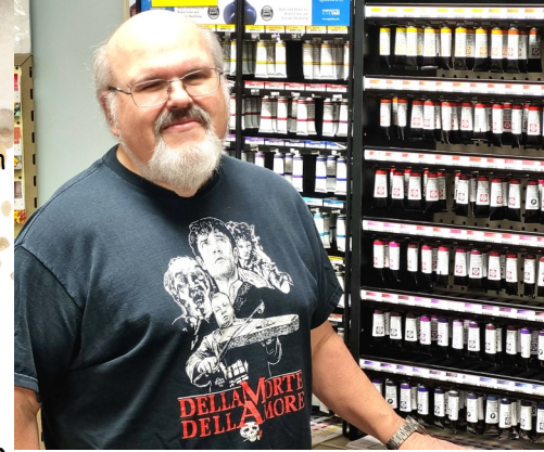
KEN can't wait to show you their fabulous range of watercolors

HOURS: M-F 9:30-6:00, SAT 10:00-5:00, SUN 12:00-5:00 1303 N. Monroe Street (large off street parking lot)